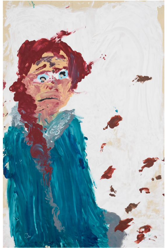
Lady Stark, 2014