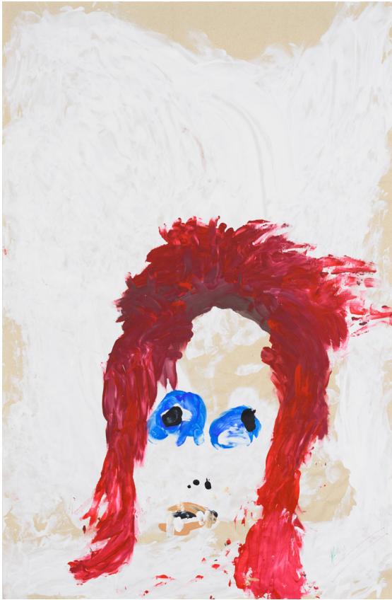
Please Send Help, 2014