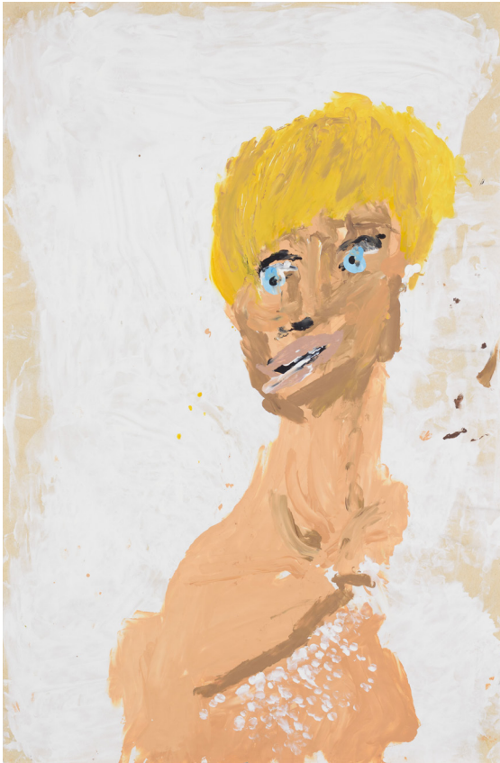
Robin Wright or A Beautiful Thin Actress, 2014

All works from the series Blind Transgender With AIDS . Acrylic on paper, 86.5 × 56.5 cm