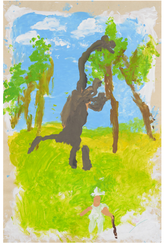
Welcome to Jurassic Park, 2014