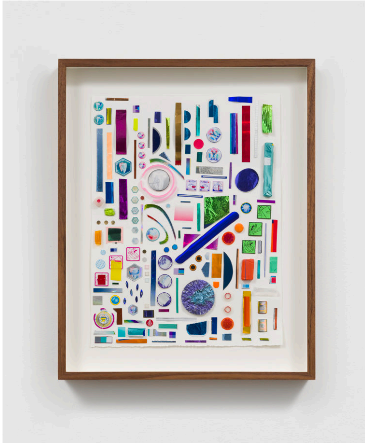
Antonio Tarsis Mining III, 2021 Collage on paper: found items (product packaging and labels) from Salvador, Rio de Janeiro, São Paulo, Lisbon, London, Venice, Stockholm, Berlin and Stuttgart. 40.2 x 32.2 x 4.4 cm

compared to what was in ours. The fridge in our house was always almost empty. In the houses where my mother worked, there were countless products and foods, but all we could do was organize them. The only possible relationship with these products was to desire them and observe the packaging.